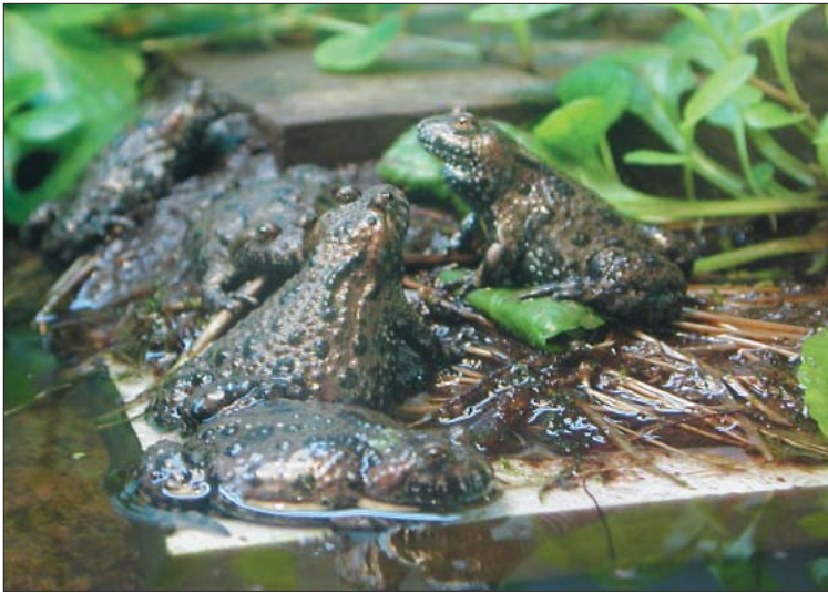
Fig. 4. Bombina bombina . 8 days after 'wake-up'. The toads aggregate underneath a light source forming clusters

trated in Figs. 2 & 3. It consists of glued-together glass plates (150 cm × 60 cm × 60 cm high). The cover features a firmly attached back plate and 2 movable front plates. Each of the front plates can be slid back (by glued-on handles) in tracks, tightly fitting over the back part. Pushing back both front plates makes the whole interior of the enclosure easily accessible. For air exchange the upper part of the back plate and the upper parts of both side plates carry perforated metal sheets measuring on both container sides 60 cm × 15 cm; on the back side: 150 cm × 15 cm (Fig. 2). The perforations in the sheets have a diameter of 2 mm.