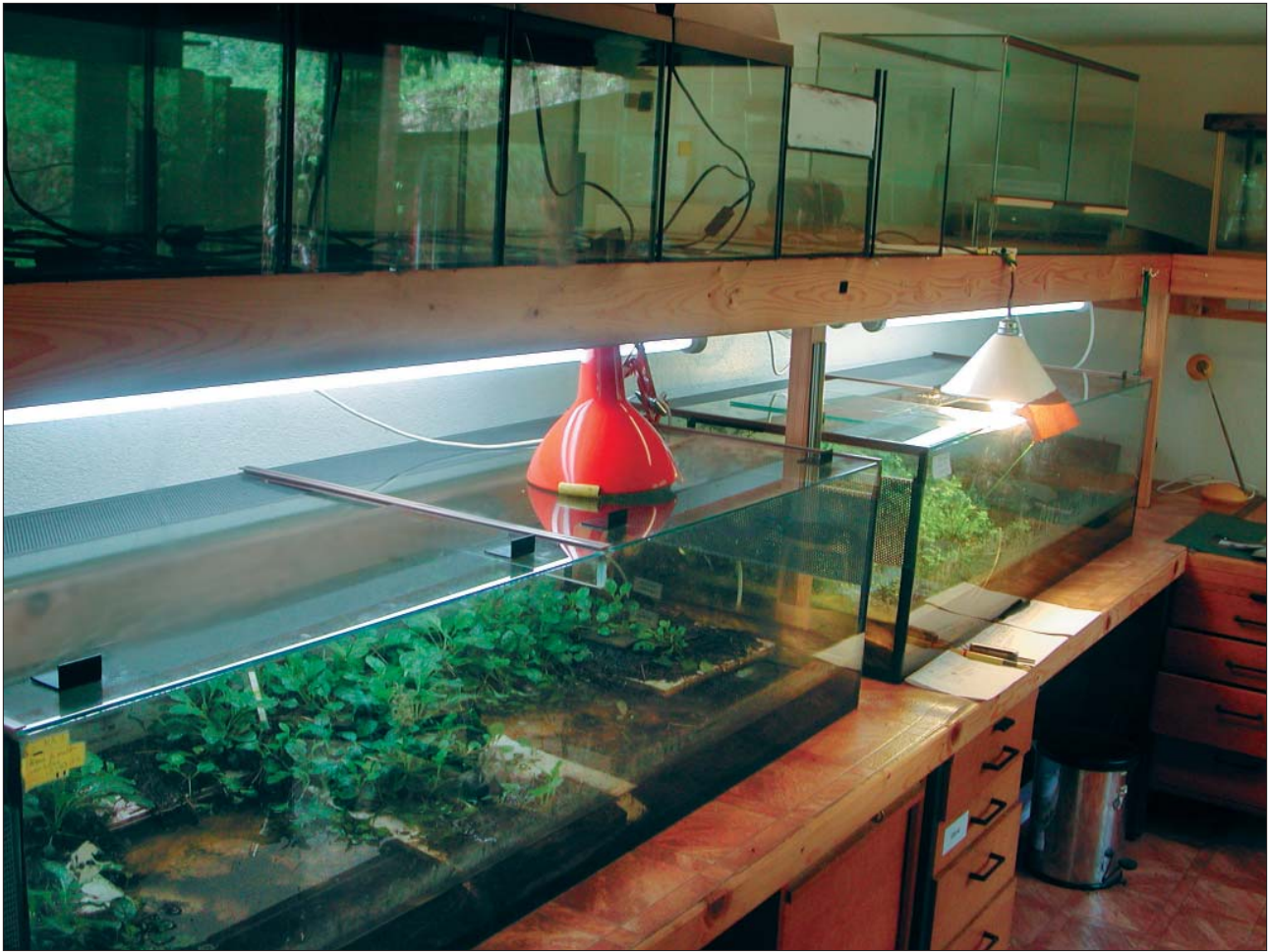
Fig. 3. Arrangement of breeding enclosures in Laboratory 2

ture control failed for 1 or 2 days and, at -4^{\circ}\text{C} , all toads in the box died. We have also placed the plastic boxes in a large walk-in freezer. In all cases—except for the temperature-control failure—100% of our over-wintered toads survived.