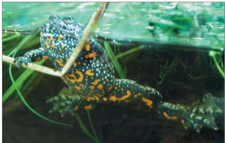
Fig. 5. Bombina bombina . Typical colouration of laboratory individuals

During the cold season, when most of these animals are not available in IR Land, we buy Acheta sp., Gryllus sp., Drosophila sp. or Musca sp. from a zoo shop. However, as soon as possible we collect food animals in IR Land. When zoo shop food and IR land food were