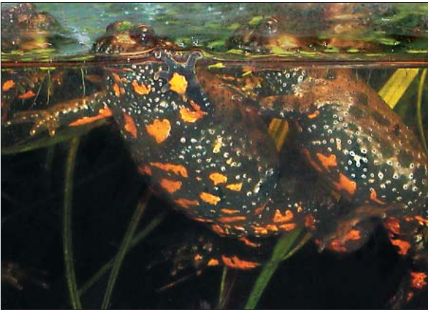
Fig. 6. Bombina bombina . Colouration of individuals in an outdoor enclosure

offered simultaneously the toads usually preferred the latter. Unconsumed or dead food is eaten by snails. Hence, a certain number of snails is considered useful.